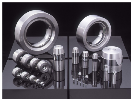
Drawing Dies & Mandrels

We have been engaged in the integrated production of these cemented carbide products, from provision of the raw metal powder to product design, sintering, casting, and product inspection at ultraprecise levels.